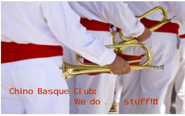
Chino Basque Club: We do . . . stuff!!!

Chino Hills Pkwy CLUBHOUSE 15181 Sierra Bonita Ln CHINO (909) 597-7982 Los Vientos Central Ave